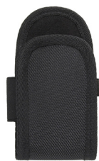
A41014-7 Universal Safety Knife Fabric Holster