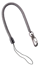
A42001-9 Clip-on Coil Lanyard