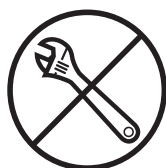
easy, no-tool blade change