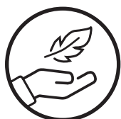
lightweight and compact