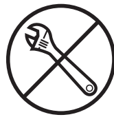
easy, no-tool blade change