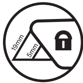
2 locked cutting depth options