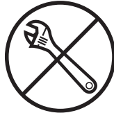
easy, no-tool blade change