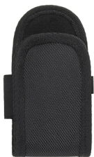
A41014-7 Universal Safety Knife Fabric Holster