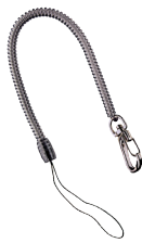
A42001-9 Clip-on Coil Lanyard