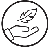
lightweight and compact